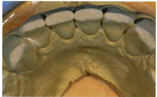
Figure 5 and Figure 6 Note generalized worn incisal edges.