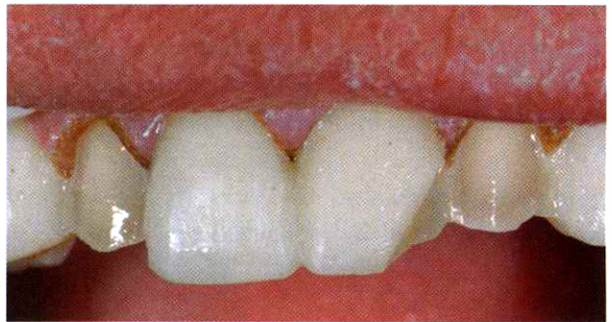
Figure 12 Anterior prototypes fractured at both lateral incisors. This is the result of parafunctional habits of abnormal posturing and protrusive bruxism.