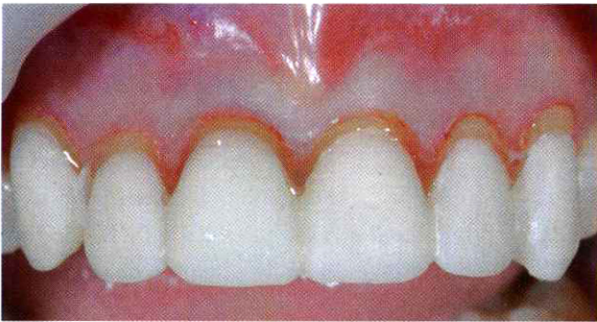
Figure 11 Composite prototypes were fabricated and luted with a combination of spot etching and bonding with veneer cement in the center of the tooth and TempBond clear cement at the periphery. It was then light-cured.