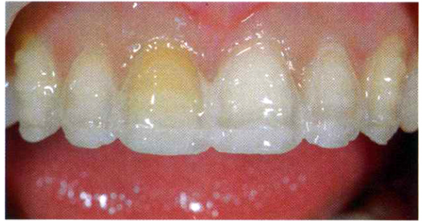
Figure 8 Depth cut guides are used across the facial prototypes.