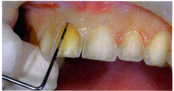
Figure 10 Probing of the labial gingival sulcus revealed a high crest relationship.