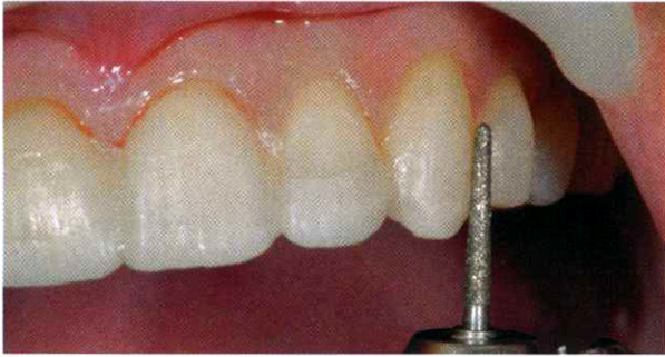
Figure 7 Application and then recontouring of the composite prototypes.