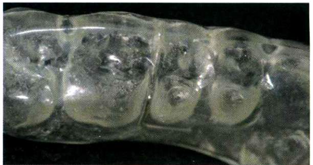
Figure 14 Nightguard verifying evidence of nighttime bruxism.