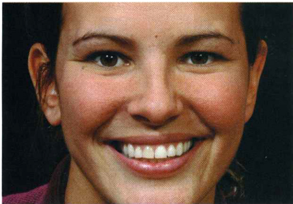
Figure 1 Preoperative view. Note the high smile line and dark central incisor.

The patient presented seeking a cosmetic solution to her smile. Her last dental examination was 2 years earlier, and she had a history of trauma to her right central incisor. She reported intermittent pain and a sense of “tiredness” on the left side of her face. She was embarrassed to smile due to her “dark front tooth” and had noticed the edges were “chipping and thinning” (Figure 1 and Figure 2).