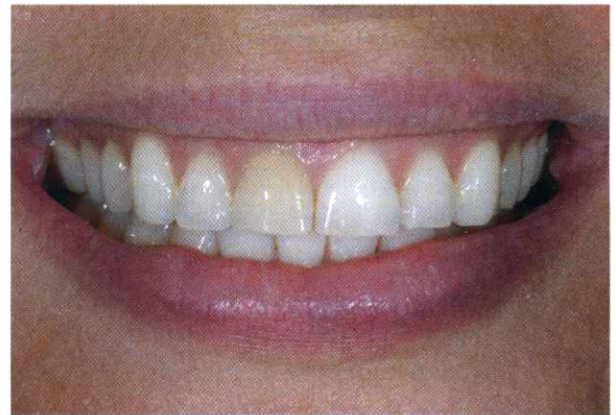
Figure 2 Close-up smile. Note high lip dynamics, diastema, and thin and broken incisal edge.