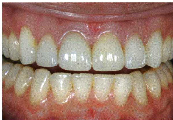
Figure 18 Postoperative retracted. Note incisal embrasures length and tissue health.

delaminations, or chipping was clinically appreciated. On periodontal recall, she was directed to bring her appliance, which displayed occlusal streaks and grooves (Figure 14).