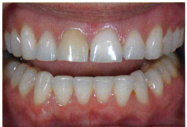
Figure 4 Note diastema, thin and broken incisal edges, and moderate attrition.