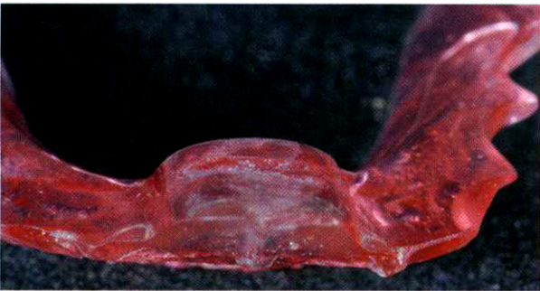
Figure 13 Acrylic is placed on the anterior ramp of the deprogrammer 4 mm high to prevent contact between the lower teeth against the maxillary provisionals in all excursions.