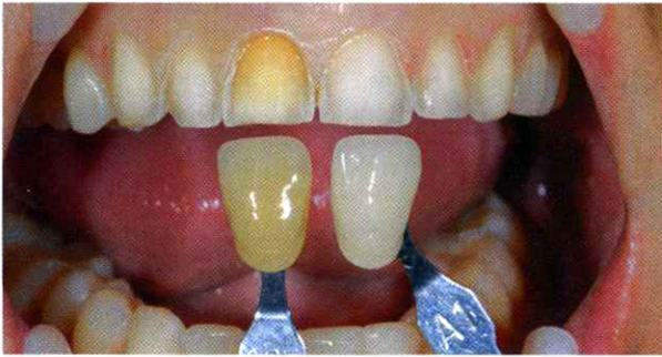
Figure 9 A deep preparation of 1 mm is necessary to provide a difference of three shades or more.