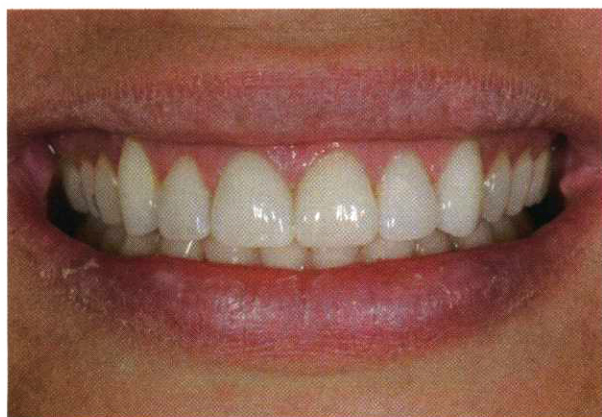
Figure 17 The postoperative smile. Note full contours and length.