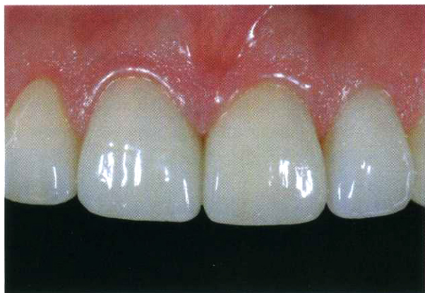
Figure 15 Postoperative 1:1 showing dark tooth and stump masked with porcelain and matching the adjacent veneer.