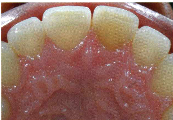
Figure 3 This cupping demonstrates that the chemical component is outpacing the frictional damage.

An individual risk assessment is critical for determining the most appropriate treatment plan. There can be multiple treatment plans but only one diagnosis. The goal is to decrease the risk and increase the prognosis with the proposed treatment plan.