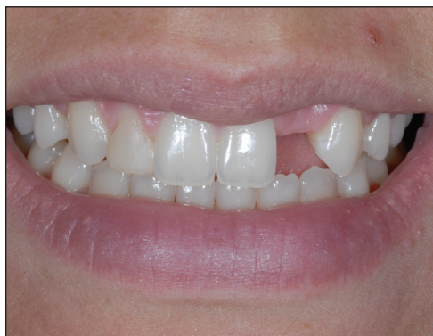
Figure 2. Pre-op smile. Tooth No. 7 was triangular shaped at gingiva with a high scallop and guarded Cupid's bow smile (high-risk assessment).