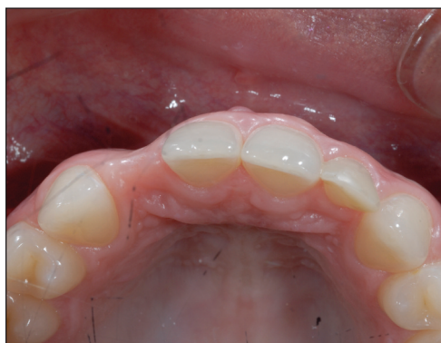
Figure 3. Incisal view. Note: tooth No. 10 showing a deficient/compromised ridge and inadequate soft-tissue topography.

team's ability to manage and deliver a natural appearing reconstruction. The ultimate aesthetic outcome requires ideal hard- and soft-tissue topography. The restoration must have natural anatomy and components of color. The patient's expectations must be understood and managed. Educating the patient about the risks and prognosis facilitates trust in the team and understanding of the proposed outcome. The restorative challenges must be identified and communicated to all team members.