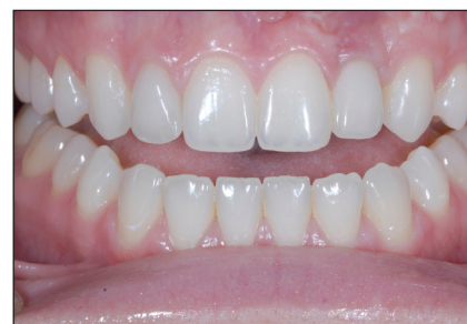
Figure 19. Post-op retracted view. Lifelike emergence profiles, tooth contours, and color.

as the facial surface of the tooth being used for comparison. These pieces were sent to the ceramist as part of the records needed for duplication of value and chroma (Figure 13).