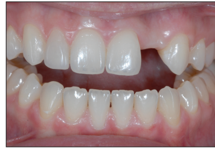
Figure 6. No. 7 composite veneer and space equalization finalized; harmonized and balanced aesthetically.