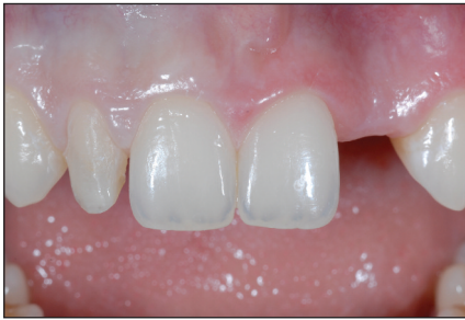
Figure 4. Right maxillary peg lateral under unsightly composite and asymmetrical centrals.