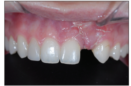
Figure 7. Post-op labial view, bone graft and implant placement completed.