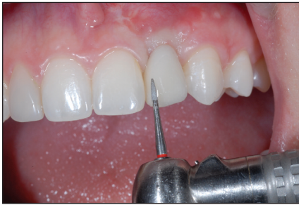
Figure 12. Flattening of the facial height of contour on the mesial facial outline form followed by adjusting the length and incisal embrasure. Note the contralateral symmetry.