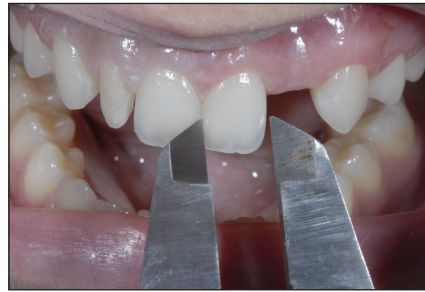
Figure 5. Measuring the mesiodistal width of teeth Nos. 8 and 9. Note: No. 9 is thinner.