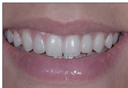
Figure 18. Post-op smile. Note the big Cupid's bow smile, normal root contours, papilla, and free gingival margin mirroring. This becomes "imperceptible dentistry."