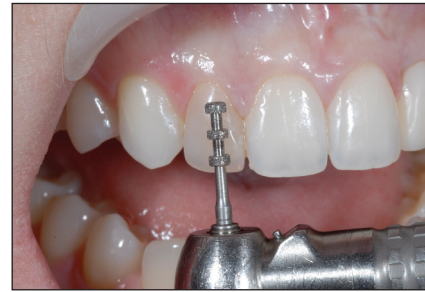
Figure 14. Depth-gauge cuts establish the amount of facial reduction.