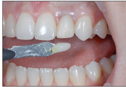
Figure 13. Custom shade tabs fabricated with composite resin (Venus Pearl [Heraeus Kulzer]). (The tab is placed in the same plane as the tooth being matched.)