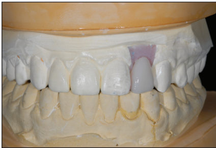
Figure 8. Lab-fabricated prototype. Note: tooth form is too square and apical in the gingival third compared to No. 7.