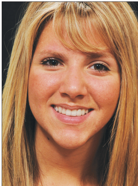
Figure 1. Patient presented with an Essex appliance with a denture tooth to replace tooth No. 10.

Dealing with more complex cases involving defects in bone, compromised soft tissue, space management, and high smile-lines (aesthetic zone challenges) will test the