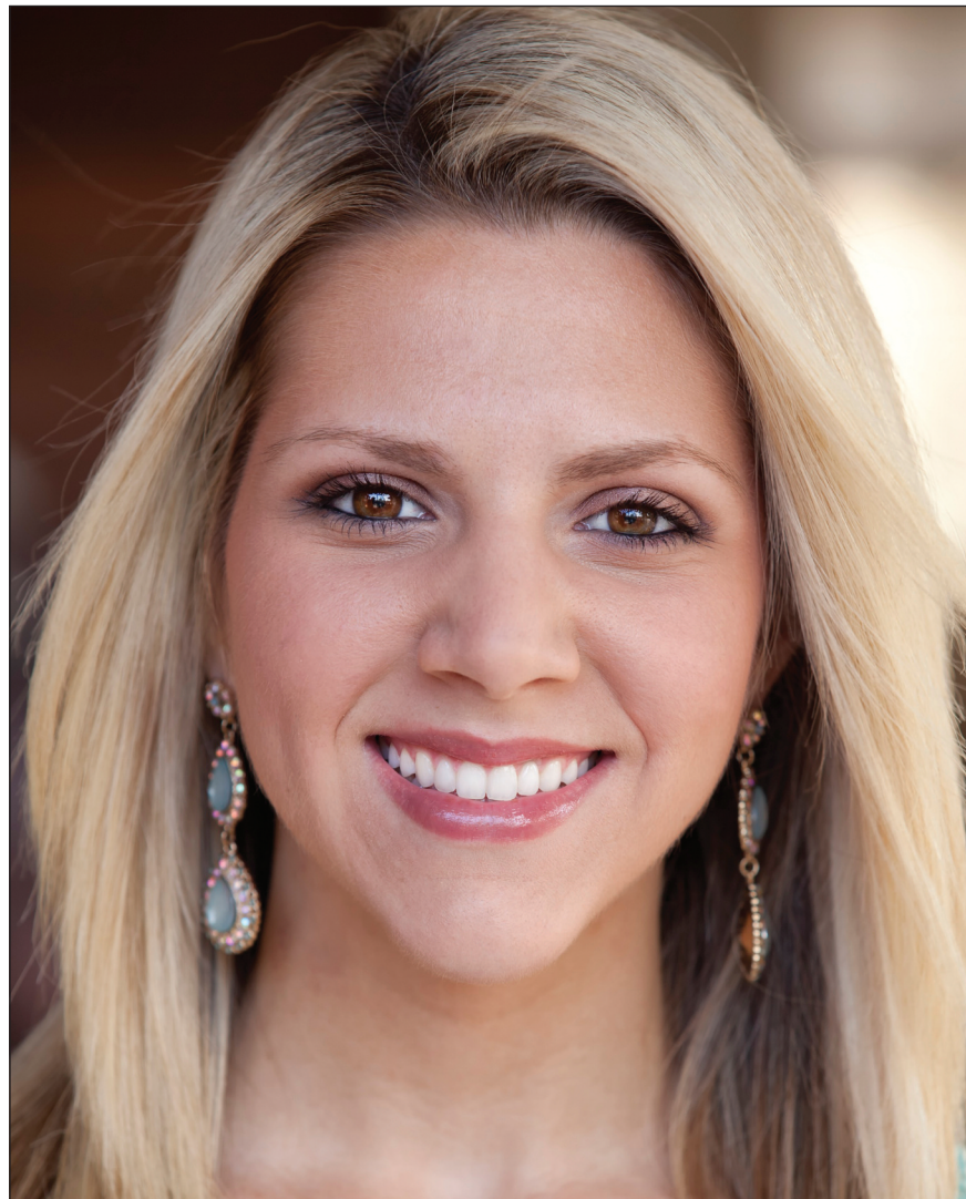
Figure 17. The patient's goal was attained: a natural, beautiful appearance.